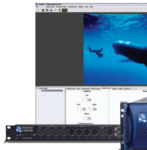
Breakout box standard with StreamZHD; optional for StreamZ.

Batch Encoding mode captures any input format to an uncompressed media file in real time and automatically transcodes it to multiple formats without user intervention, enabling easy encoding to even the most complex combinations of formats. Existing media files from differing resolutions, frame rates and sources can be transcoded to any other output format and concatenated if desired.